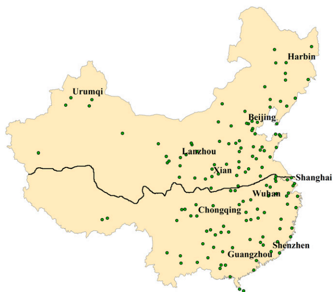
Fig. 1. The cities shown are the locations of the Disease Surveillance Points. Cities north of the solid line were covered by the home heating policy.

TSPs for 90 cities from 1981 to 2000. These data were compiled through a combination of hand entry from Chinese-language publications and access to electronic files (11). We obtained the data by combining the results of a World Bank project with information from hard copies of China Environment Yearbook to generate a single comprehensive file of air pollution across Chinese cities for our period.